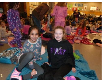
5<sup>th</sup> graders waiting for movie to start