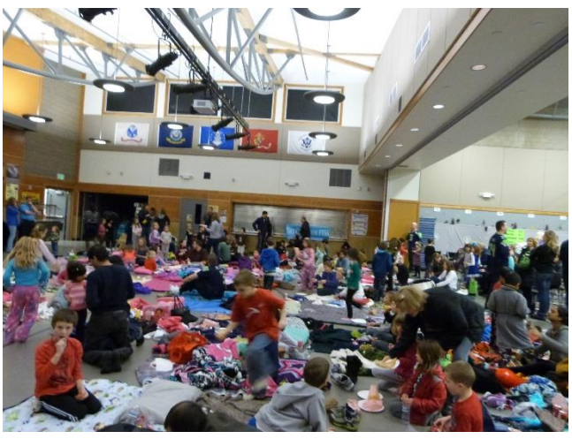
Everyone gets comfy with sleeping bags