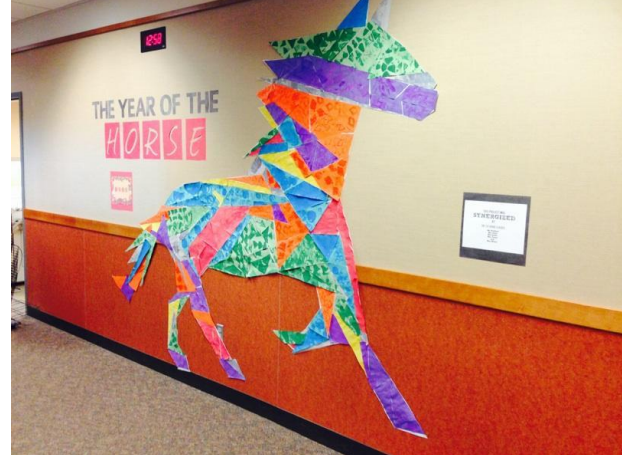
1<sup>st</sup> Grade Shapes Collage art