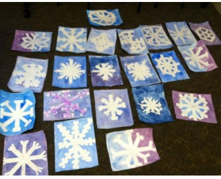
3<sup>rd</sup> Grade Snowflakes