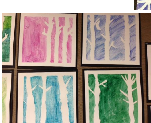
4<sup>th</sup> Grade Watercolor Birch Trees inspired by Kesler Woodward