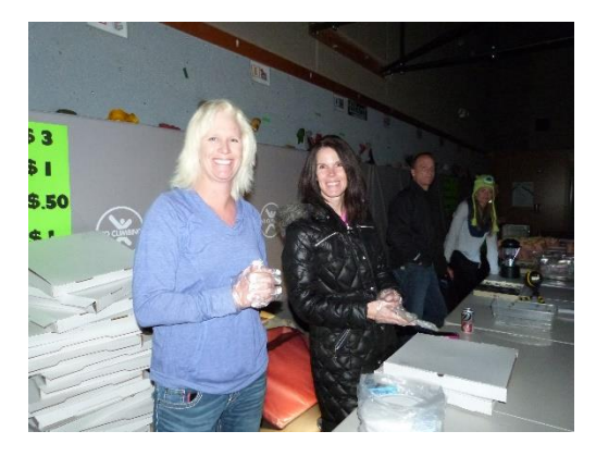
Pizza station busy all night long !