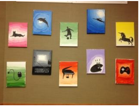
5<sup>th</sup> Grade Color Value Silhouettes