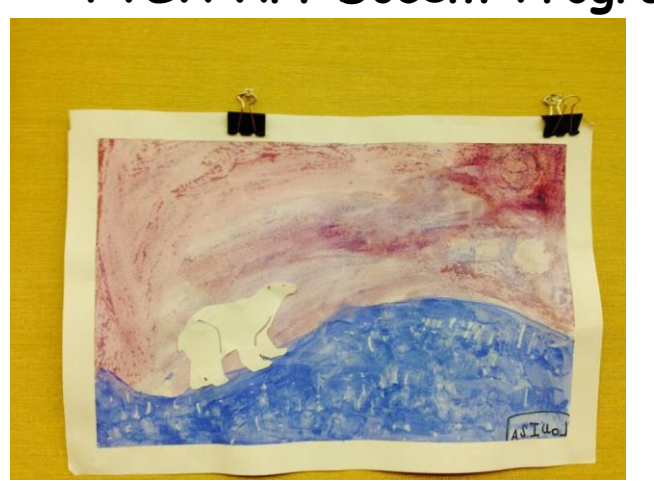
Kindergarten Watercolor with Texture