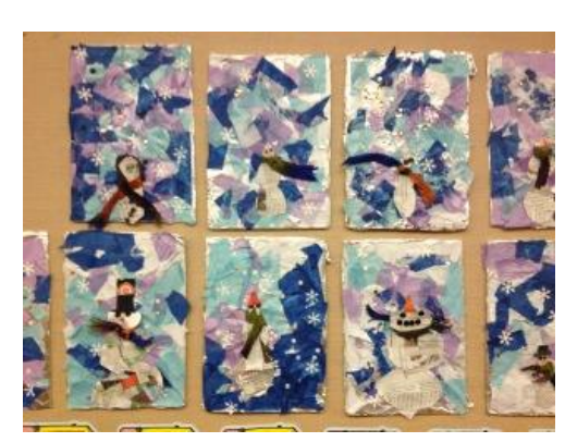
2nd grade Collage Snowman

\mathbf{1}^{st} Grade Perspective Snowmen